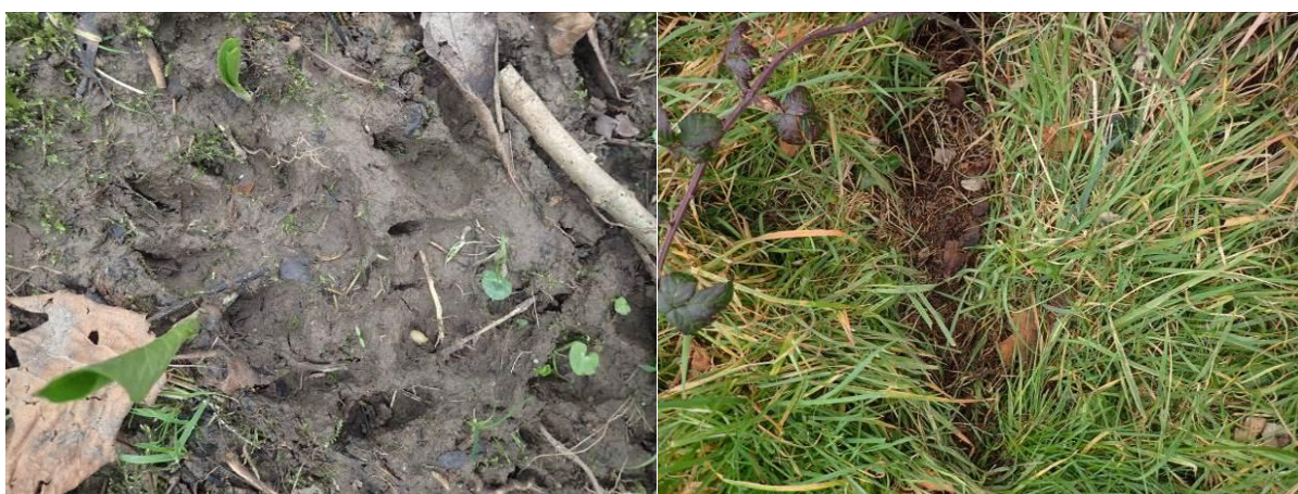
Plate 6-11: Badger footprint in woodland to the west of proposed infrastructure (left). Badger snuffle hole (right).