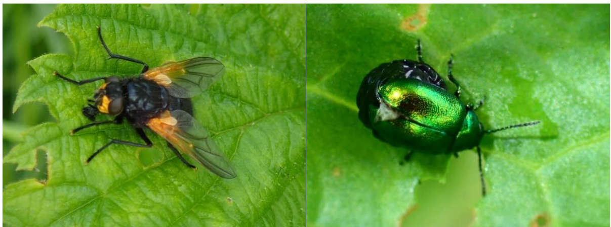
Plate 6-16: Noon fly and green dock beetle encountered at the site during May 2022.