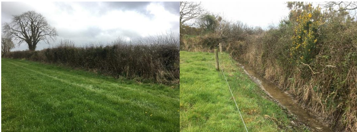
Plate 6-3: Typical managed hedgerow WL1 present at proposed T5 (left). Typical drainage ditch FW4 (right).