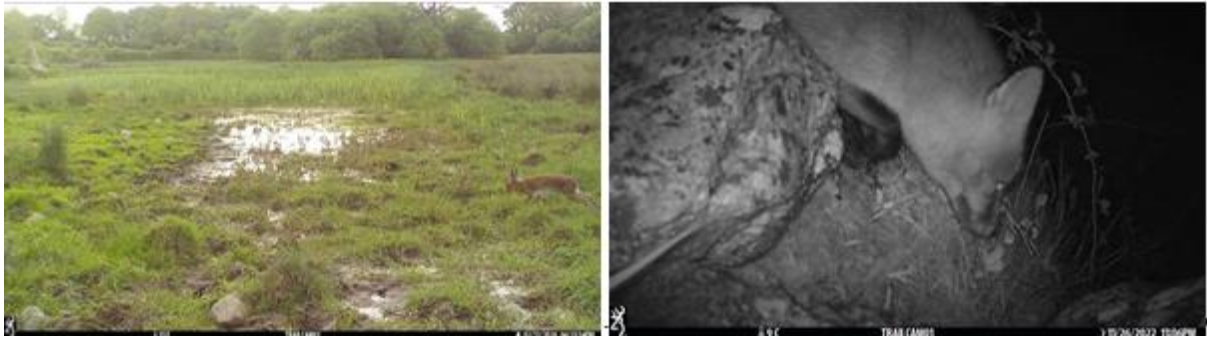
Plate 6-14: Hare at trail camera 10 (left) and fox at trail camera 5 (right).