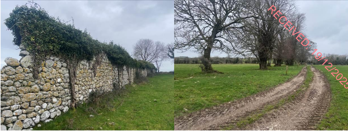
Plate 6-4: 'Stone wall and other stonework (BL1)' with ivy cover (left). Treeline WL2 and 'spoil and bare ground ED2' (right).