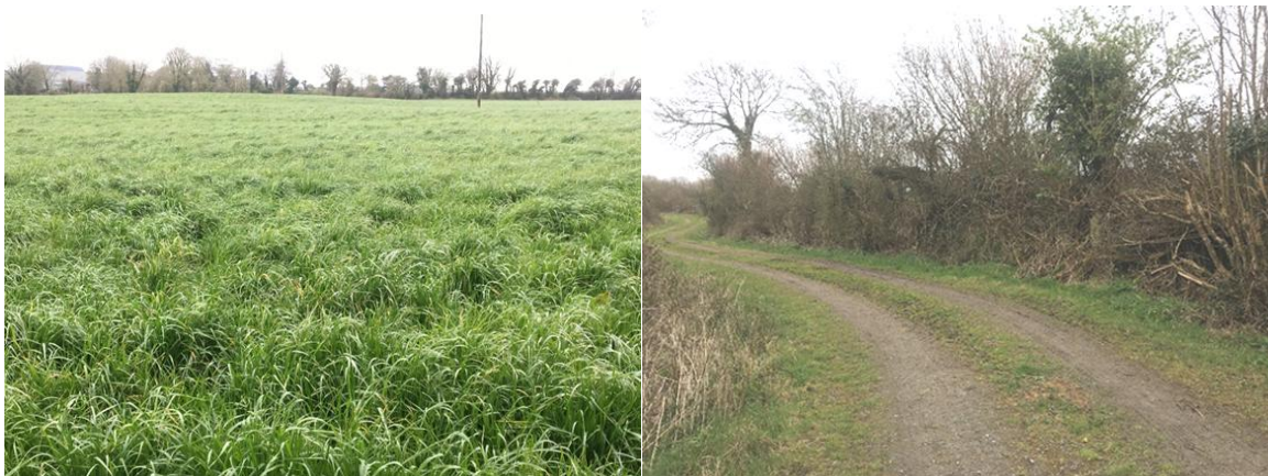
Plate 6-2: Overview of typical improved agricultural grassland habitat GA1 (left). Typical site hedgerow WL1 (right).