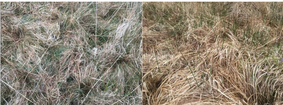
Plate 6-9: Close up of typical species poor/rank Molinia dominated wet grassland GS4 community present within the location of a proposed 5m site access track.