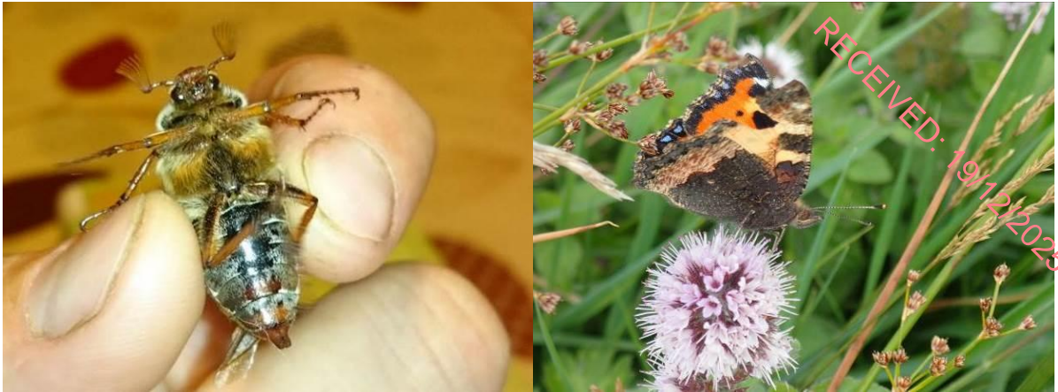
Plate 6-17: Common cockchafer (left) and small tortoiseshell Aglais urticae (right).