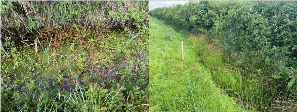
Plate 6-5: Examples of drainage ditches at the site