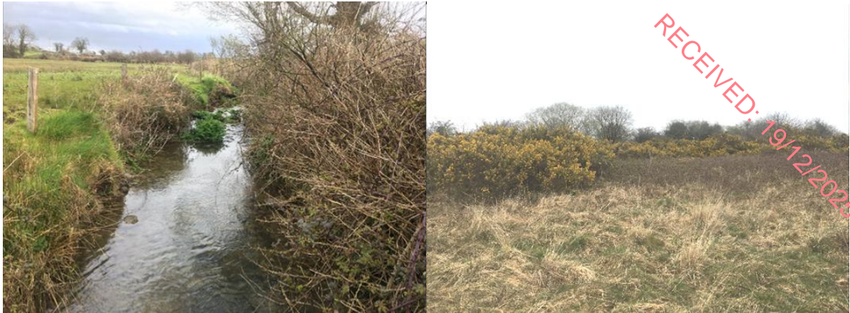
Plate 6-7: The Ahacronane River FW2 (left). Scrub WS1 at location of proposed track to T3 (right).