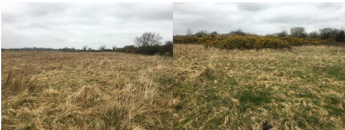
Plate 6-8: Overview of Molinia dominated wet grassland GS4 present within the location of a proposed site access track (left). Wet grassland GS4 and scrub WS1 area associated with the proposed location of T2 and associated access track (right).