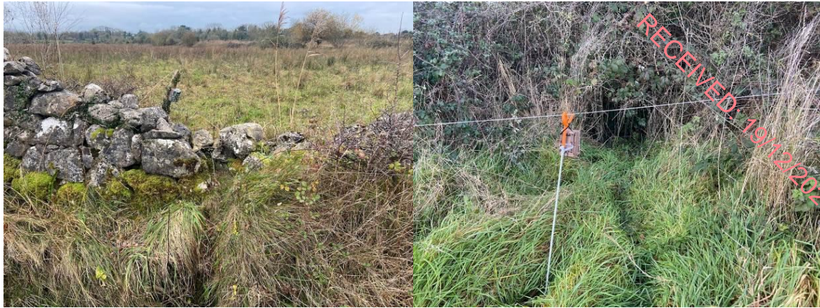
Plate 6-1: Trailcam set out on the 15 th October (trailcam 5, left) and 20 th December 2022 (trailcam 4, right)