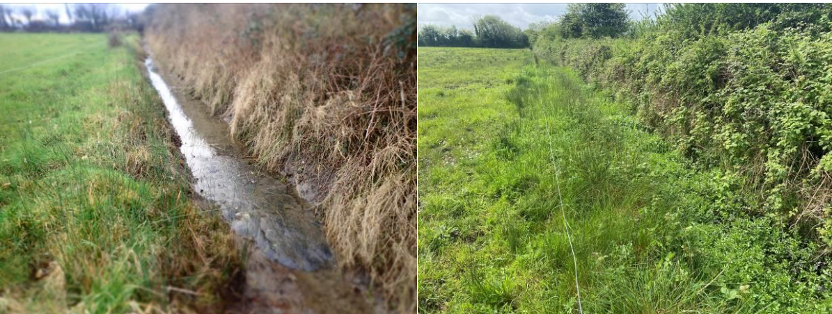
Plate 6-6: Drainage ditch in March 2022 (left) and in May 2023 (right).