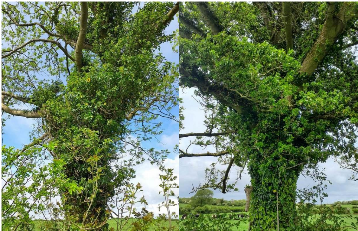
Plate 6-18: Mature ash trees in hedgerows within the site boundary with ivy cover, cavities and cracks which have the potential to be used by roosting bats.