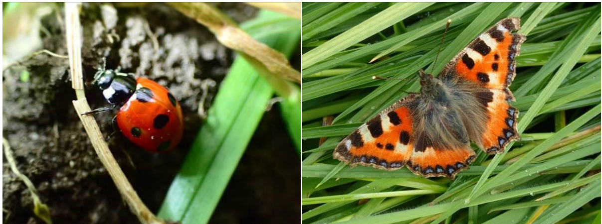
Plate 6-15: Seven-spot ladybird and small tortoiseshell encountered at the site during May 2022.