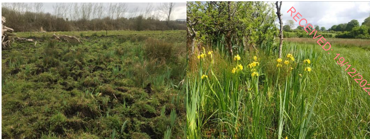
Plate 6-10: Wet grassland GS4 present within improved agricultural grassland GA1 to the north (left). Poor fen and flush PF2 to the south east of T6 (right).