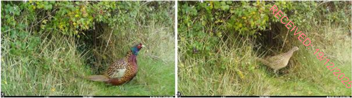
Plate 6-13: Pheasants at trail camera 4.